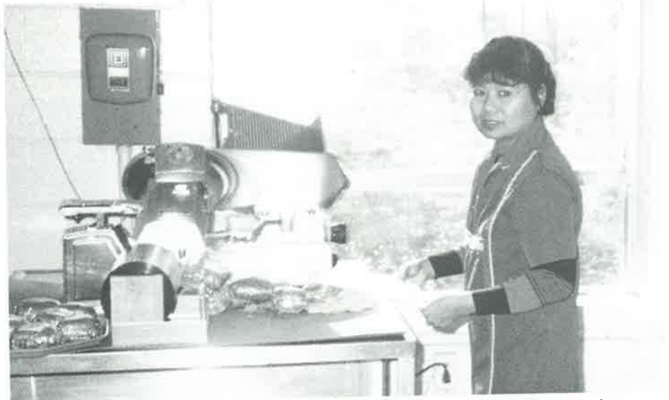
KP Cummins Thoom is seen wrapping up meat to be refrigerated.