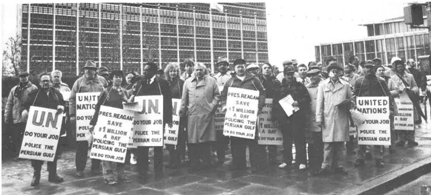
Unions demonstrate at United Nations to push for naval force to end deaths of seamen in Persian Gulf tanker war.