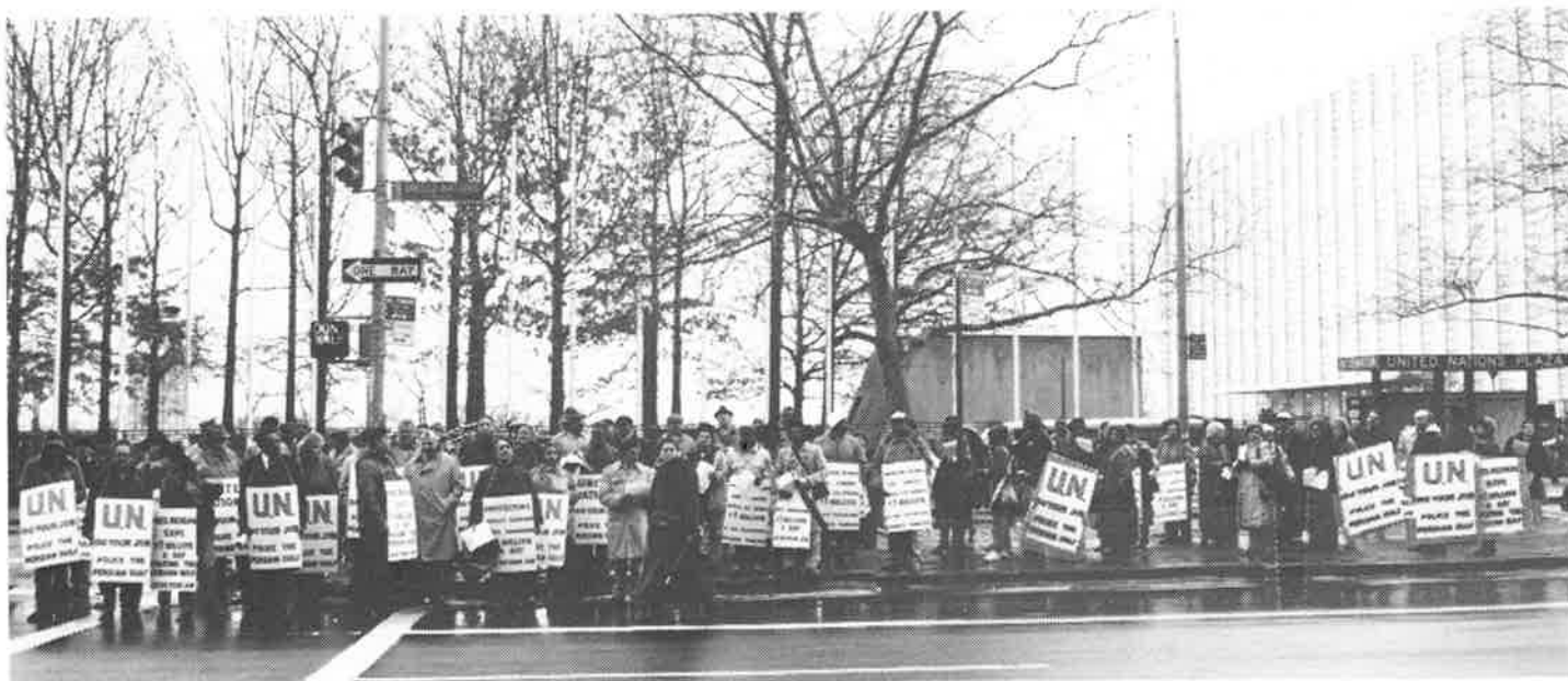
Demonstrators from NMU and other U.S. and European maritime unions as well as shoreside members call upon the United Nations to "do its job" by setting up protective naval force to guard all ships caught in Iran Iraq tanker war.