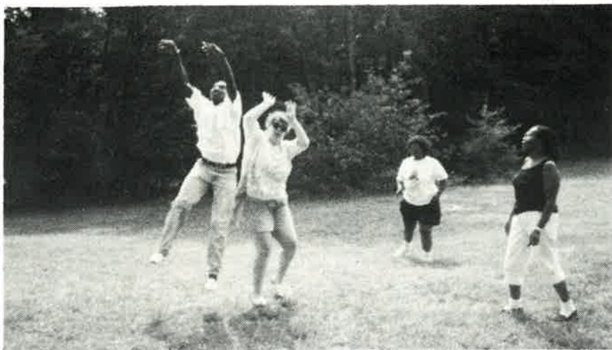
Food service workers go at it in a friendly game of volleyball.